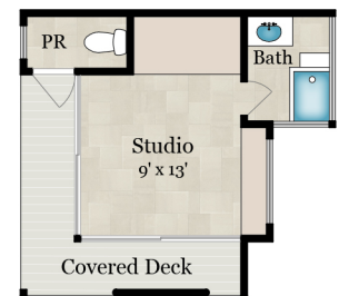
DETACHED STUDIO 2 190 SQ FT

Above-Grade: 6,030 SQ FT Below-Grade: N/A Calculated per ANSI Standard Z765-2003