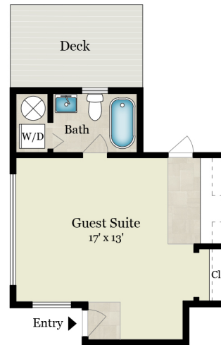
GUEST HOUSE 395 SQ FT