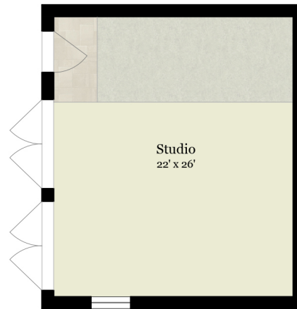
DETACHED STUDIO 1