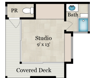
JAPANESE GUEST HOUSE